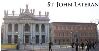
ST. JOHN LATERAN

Then, we proceed to the Cathedral Church of the pope, St. John Lateran . Constantine built the original church on this site when he ended the Christian persecutions. Here we see the Altar that holds the relics of Sts. Peter and Paul. Next to the Basilica is the Baptistry and across the street visit la Sancta Scala (Holy Stairs), which were transported from Pilate's palace in Jerusalem and on which our Savior climbed before His crucifixion. Those who wish to pray each step on their knees may do so. The option to take the side stairs on foot is also available.